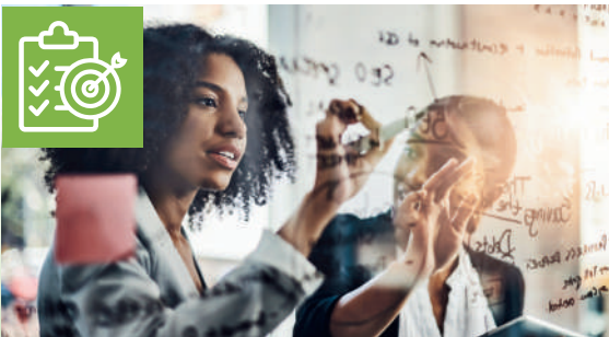
Goal Setting & Accountability Support