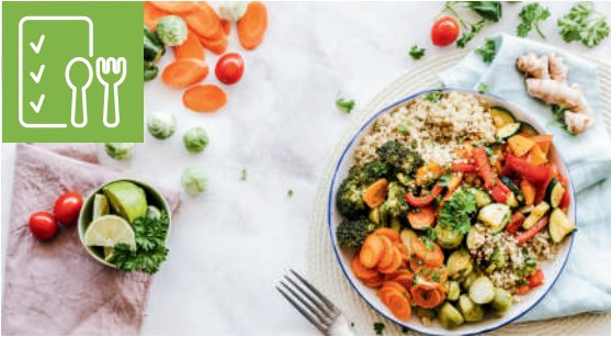
Personalized Nutrition Guidance