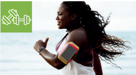
Fitness and Exercise Planning