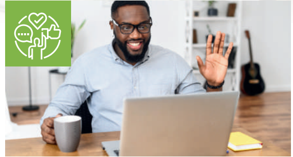
Lifestyle and Behavioral Coaching