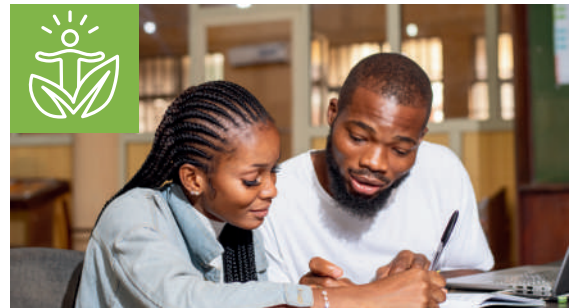
Wellness Workshops and Education